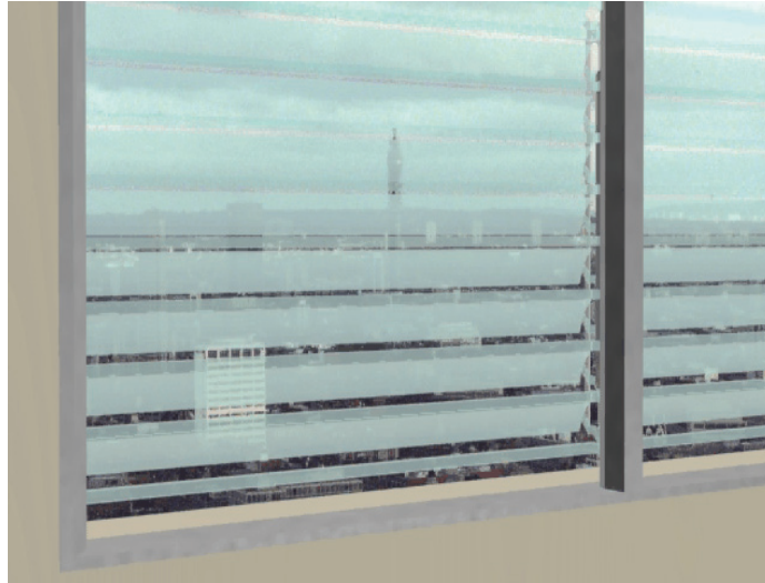
Figure 1. Impression of a BISC Venetian blind